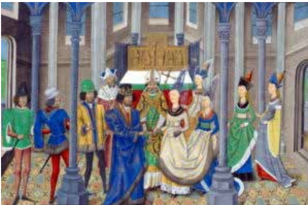
1387 – _____ makes the alliance stronger.