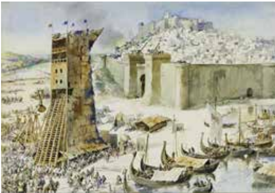
1147 – _____ - the origins of the alliance: The English help the Portuguese recover Lisbon from the Moors.