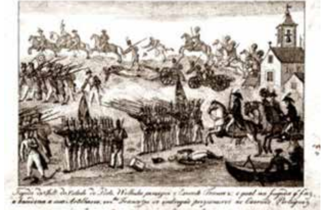
1807-1810 – _____ – Britain helps Portugal defend itself and expel the French.