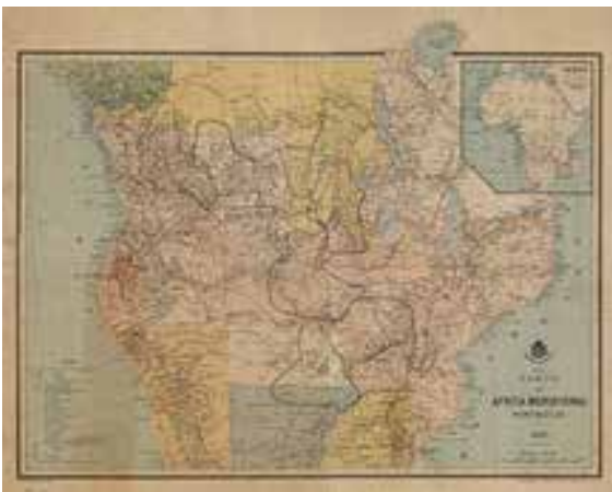
1886 – _____ – Portugal and Britain disagree on the division of colonies in Africa.