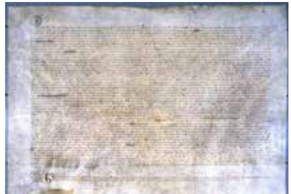
1373 _____ is one of two treaties signed to start the alliance.