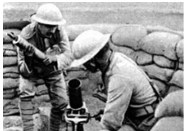
1914-1918 – _____ – Portugal takes part and supports its oldest ally.